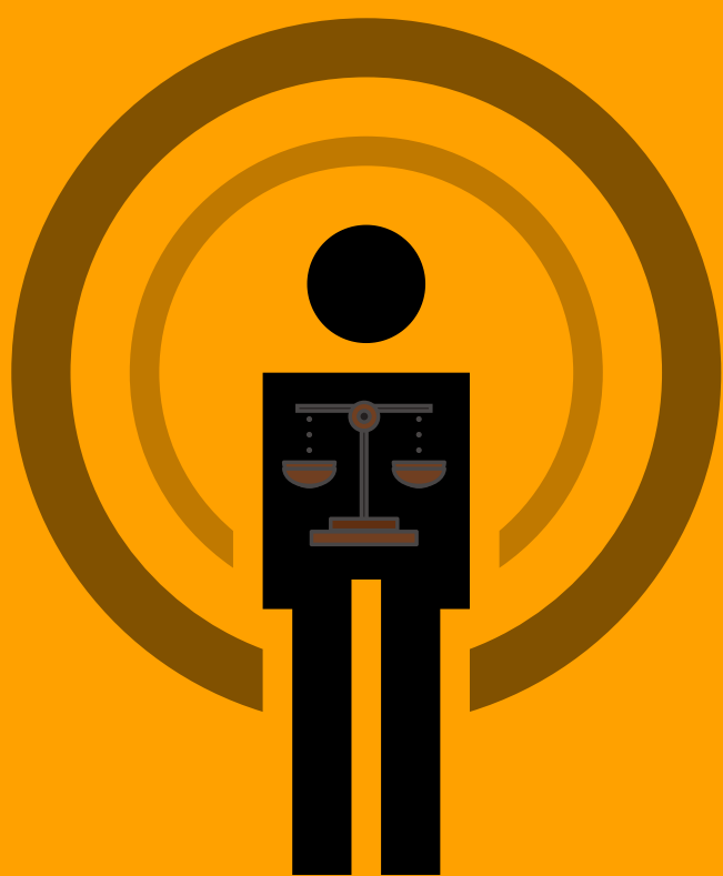
Lines of Development