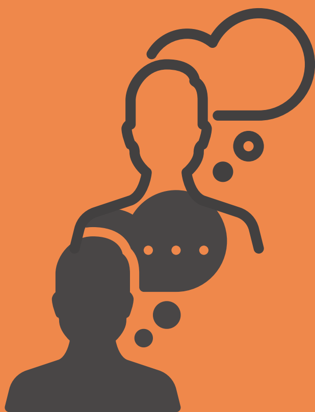
State of Learning